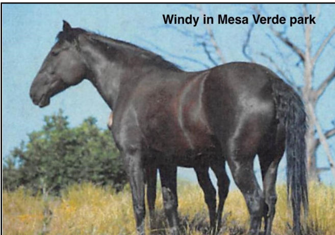
Windy in Mesa Verde park

Windy is a Mesa Verde Mustang. She is a well-built, 12-year-old, exquisite ebony mare standing gracefully at 14.1 hands tall.